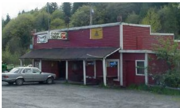
The Historic Goble Tavern

Goble, Oregon is a very small town between Hunter Bar and Trojan on highway 30 in northern Oregon. It was named